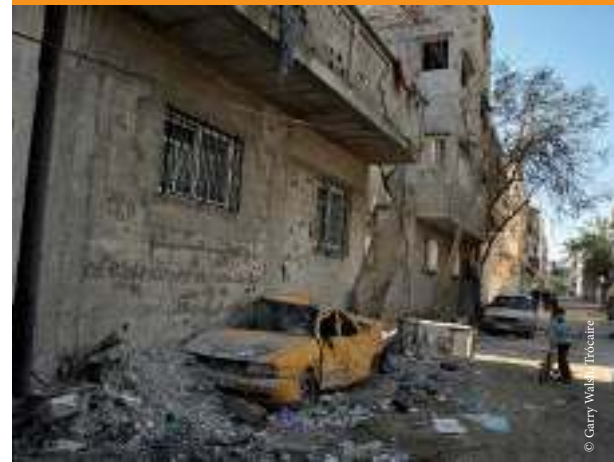
Gaza residential area affected by the November 2012 aerial bombings

Given the EU's commitments to promote respect for international humanitarian and human rights law, as well as its influence as a major donor to the Palestinians and trading partner of Israel, there is still a range of actions it could take to address violations on the ground.