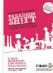
Bringing about a paradigm shift: Towards a just and sustainable world - a new narrative for human well-being Interactive report of CIDSE workshop

Please visit www.cidse.org for a full overview of other 2013 documents, including statements, recommendations and leaflets.