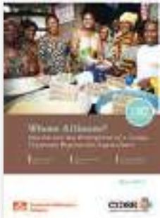
Whose Alliance? The G8 and the emergence of a global corporate regime for agriculture CIDSE and EAA recommendations

CIDSE has a strong tradition of publishing policy papers, reports and statements which are highly valued by decision and policy makers and journalists alike, as well as those within the CIDSE network and the wider development community. The following are a few key publications from last year: