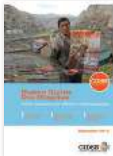
Human Rights Due Diligence: Policy measures for effective implementation CIDSE recommendations