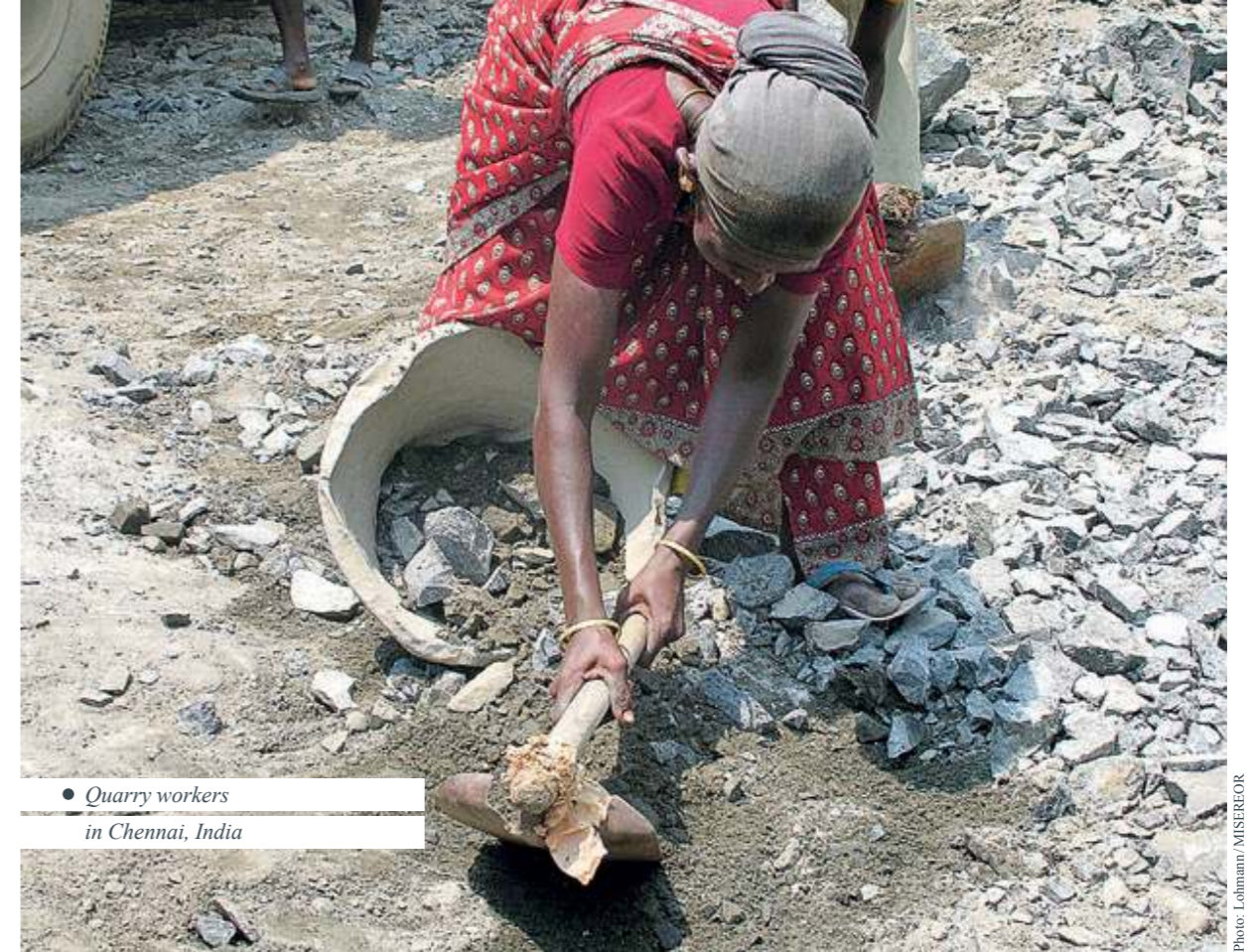
● Quarry workers in Chennai, India

Despite the scientific evidence of the kinds of health damage commonly caused by their products, companies who produce these pesticides have almost never been held accountable for this damage. 31 This is because, in the framework of civil compensation claims, it is extremely difficult to prove that the corporations producing the pesticides are legally responsible for the harm in question. In particular, it can be difficult to determine the causal link between the production of pesticides and chronic damage to