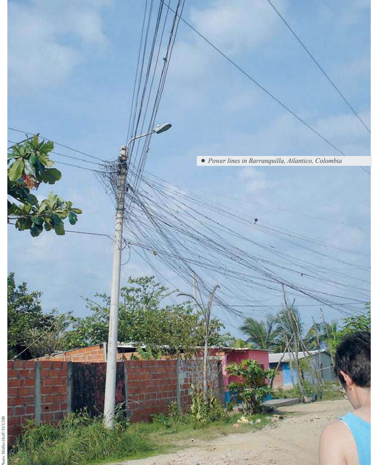
● Power lines in Barranquilla, Atlantico, Colombia

One of the basic legal standards of German corporate law is the corporate veil doctrine, according to which separate legal entities such as parent and subsidiary companies are liable only for their own infringements. Thus a parent company is, in principle, not liable for the obligations