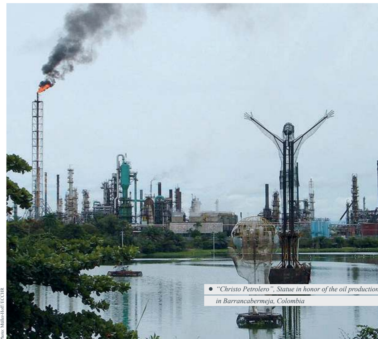
● “Christo Petrolero”, Statue in honor of the oil production in Barrancabermeja, Colombia