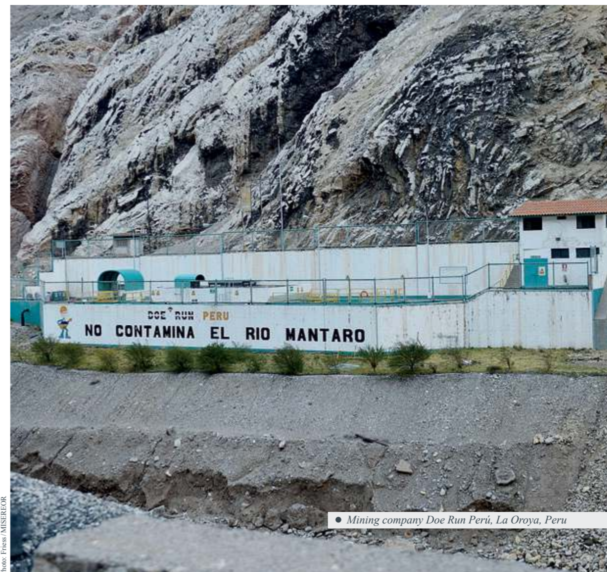
● Mining company Doe Run Perú, La Oroya, Peru

Additionally, increased heavy metal pollution in drinking water and soil cause damage to agriculture and livestock farming. Once mines are in operation, farmers consistently report declining crops as well as an increase in animal deformities and livestock deaths. These losses in agricultural production have forced many residents to leave their original settlements; the new settlements provided for resettlement, however, often prove to be insufficient. 28