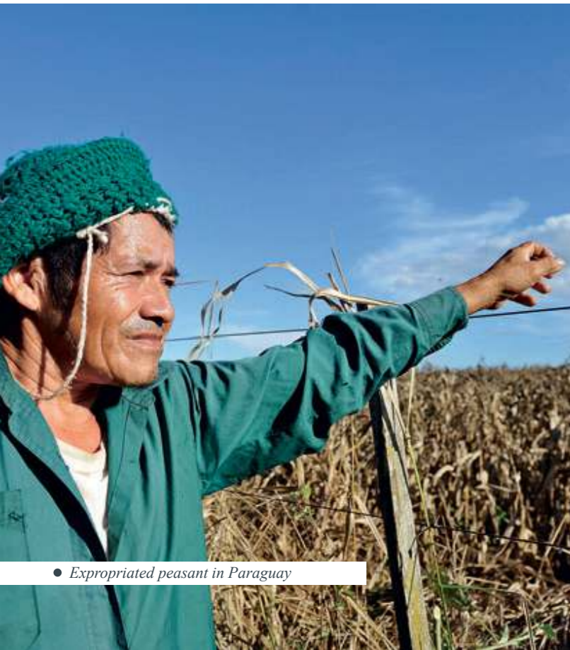
● Expropriated peasant in Paraguay

major Western transnational corporations often invest in land for agricultural use. 14 European and North American agricultural corporations secure land predominantly to grow crops such as corn, sugar cane and oleiferous plants for energy production. 15 There are countless globally active companies operating in the field of extractive production of raw materials like coal or precious metal mining. 16 These companies develop and operate mines