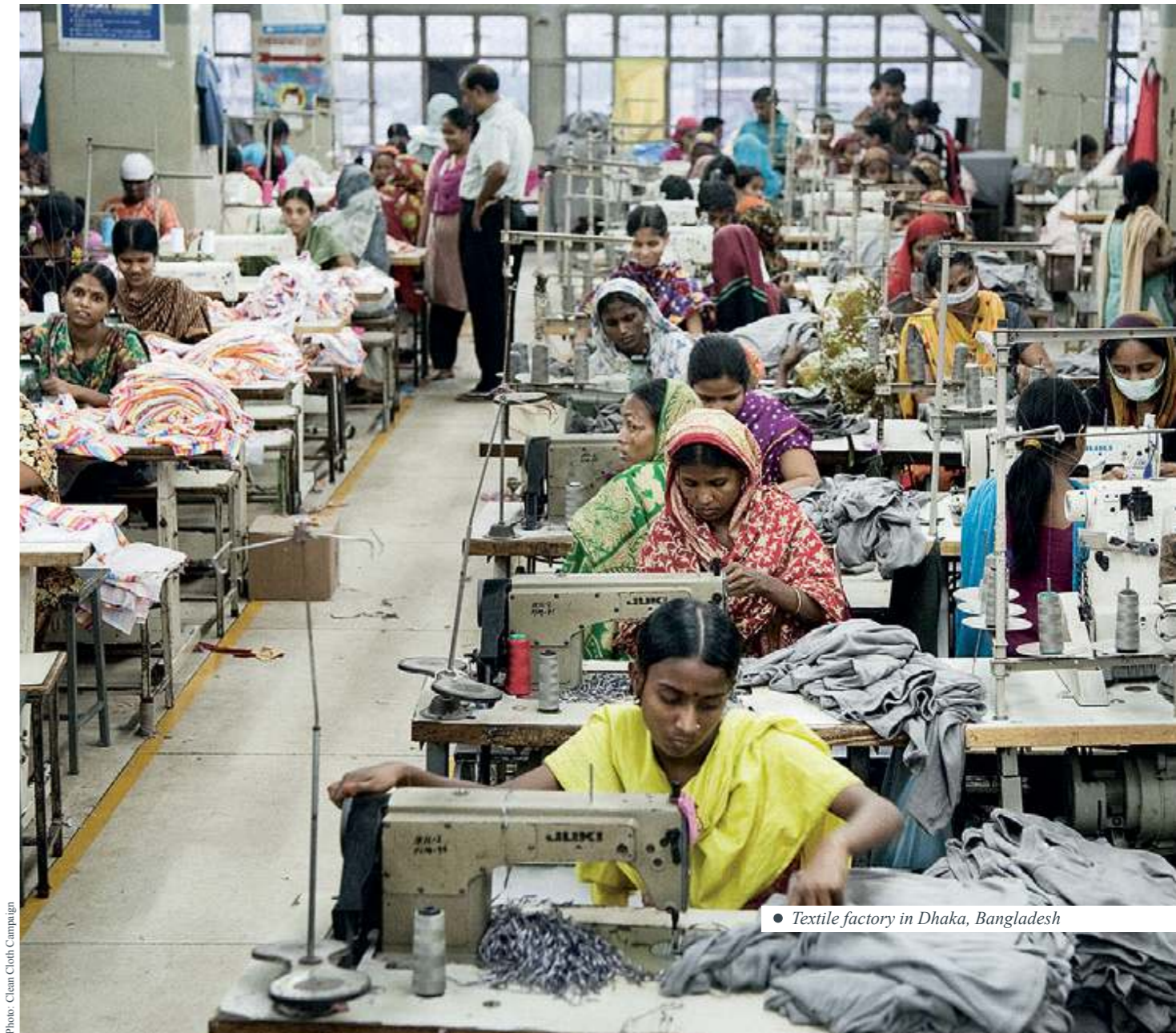
• Textile factory in Dhaka, Bangladesh