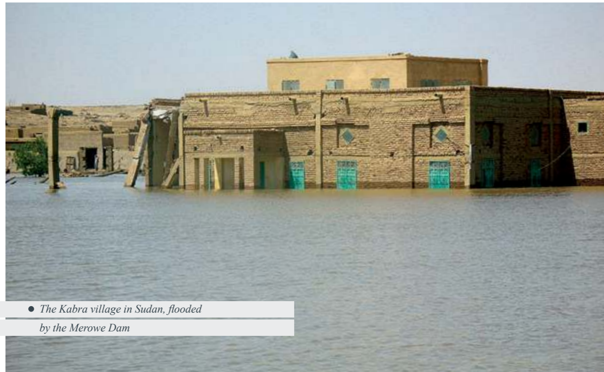
● The Kabra village in Sudan, flooded by the Merowe Dam