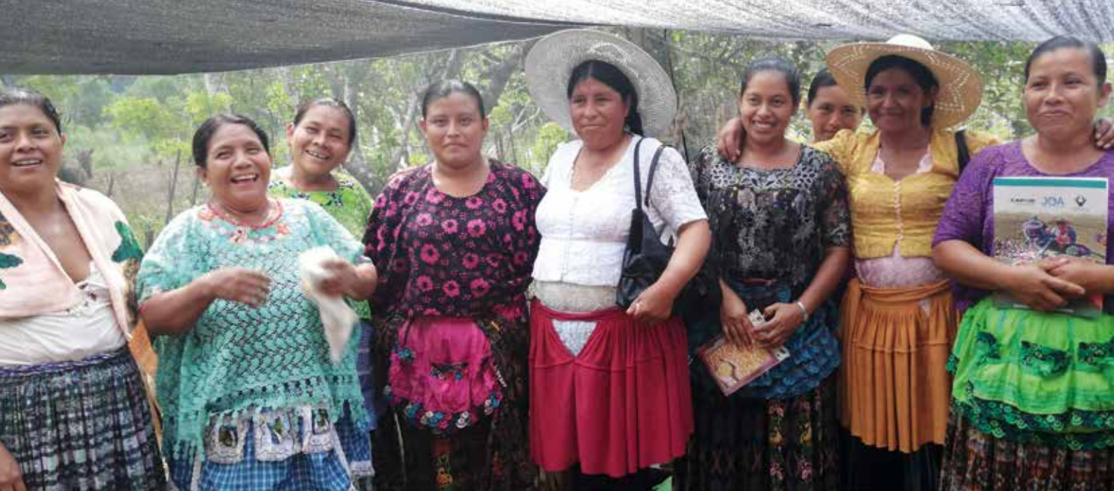
Agroecology, food sovereignty, solidarity economy and feminism are aligned movements that work towards building other ways of being in the world.

bly (p. 21) suggests that the risk of co-optation can be greatly reduced when movements organise not around agroecology as a practice, but around more fundamental demands, including those for women's leadership, horizontal ways of collaborating and for perspectives that emphasise care rather than profit or control.