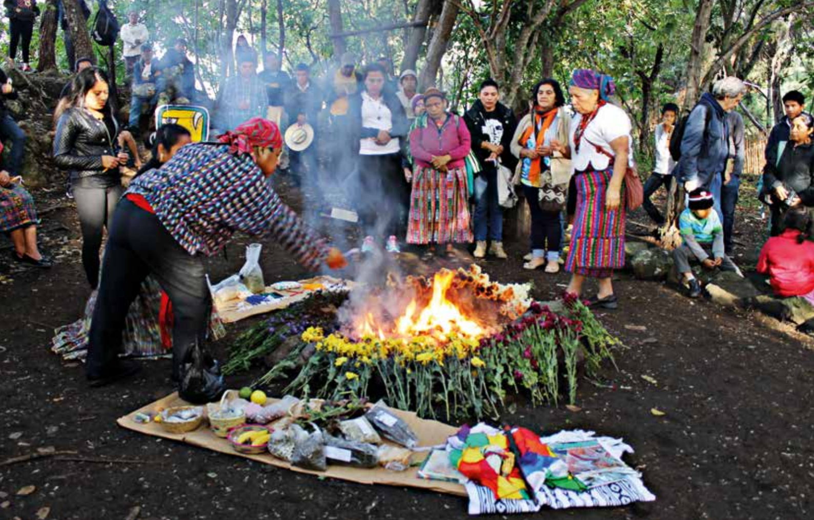
Our identity is our history and our history is our identity.

‘Scorched Earth’ policy, which consisted of violently removing rural crops, houses and people. Indigenous peoples’ and peasants’ property documents were erased to pave the way for land appropriation.