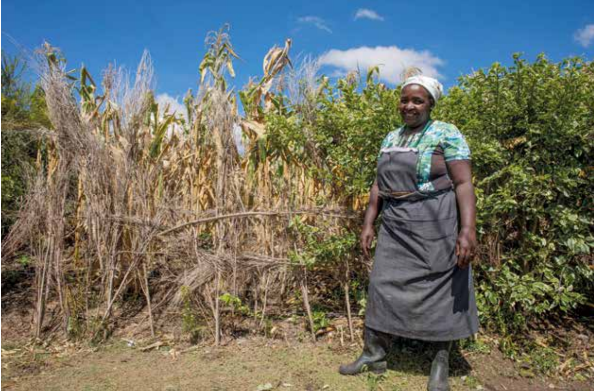
“The majority of people who till the land are women. But who controls the resources?”

market go up, men tend to leave home, go to the nearest town and spend all the money. That is why it is important to start a dialogue about food production and who controls the resources.