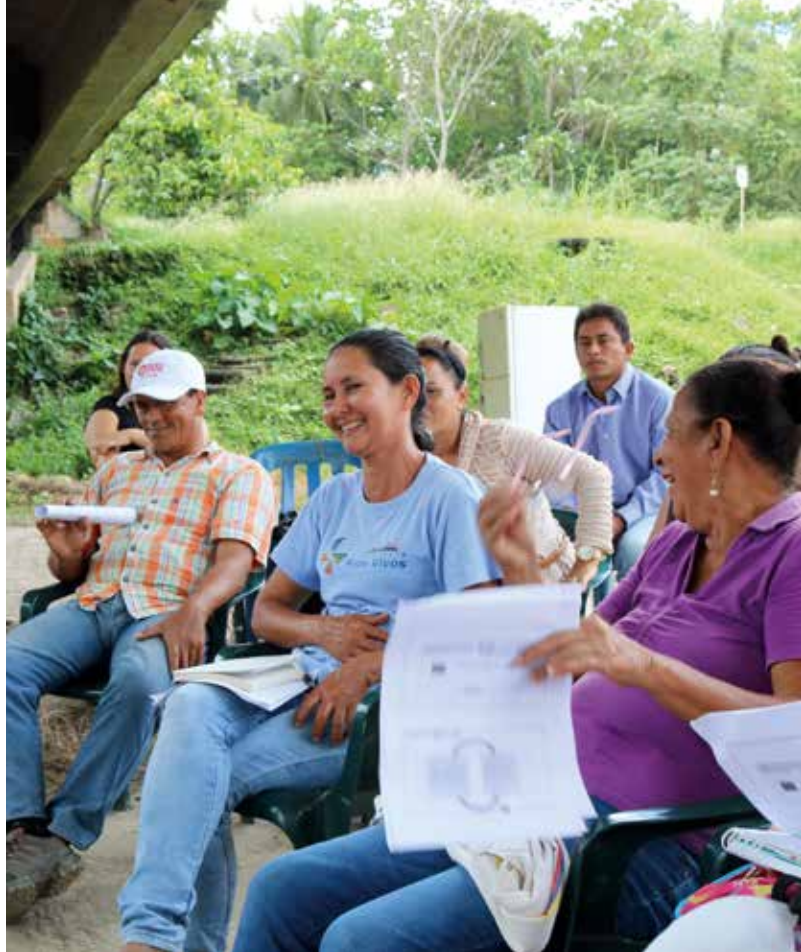
An agroecology gathering of farmers in La Playa, Santander, Colombia.

These developments have shown how agroecological spaces, originally primarily dominated by women,