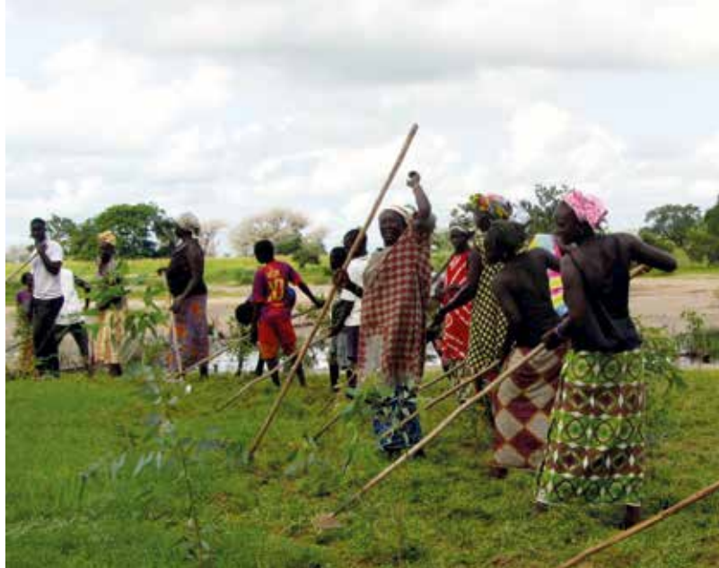
We cannot assume that agroecology is already feminist in itself.

A feminist agroecological transition must go hand in hand with changes in relationships and roles between men and women in their homes, building new forms of coexistence. This, together with the equal distribution of care work, would allow women to occupy some of the spaces that are currently taken up by men.