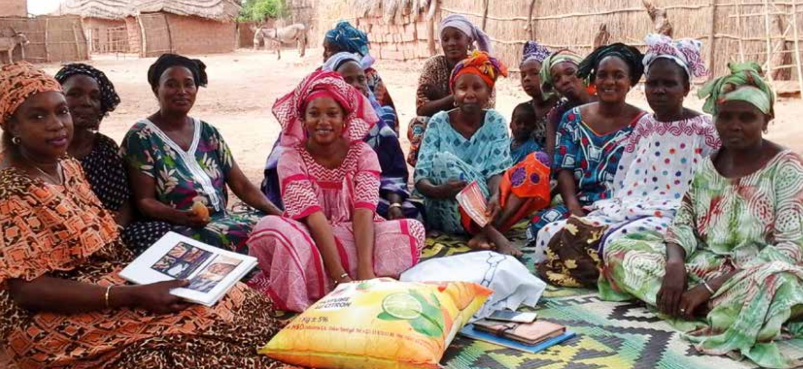
Women's credit groups bolster leadership, solidarity, and self-confidence.

communities have reformed governance at the community and municipality levels, strengthening the position of women in the process, including those from the most vulnerable families.