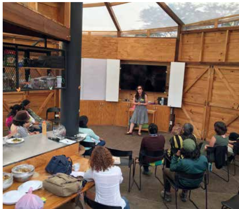
Workshop on health and nutrition at the Aula Huerto.

The Aula-Huerto The Aula-Huerto consists of three spaces. There is a classroom-kitchen-laboratory called “ El frijolón ” where people in the scholar’s community can share healthy, locally produced food. It also has a greenhouse, where seeds are dried and