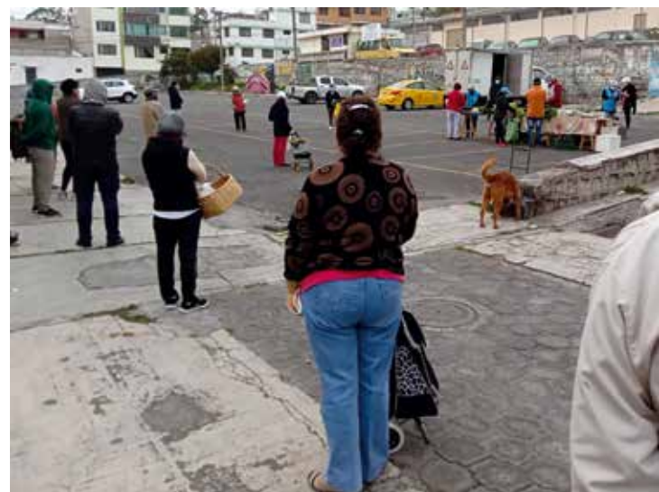
Social distancing at the Carcelen market in the North of Quito.

The Colectivo and MESSE consider the production and exchange of food as fundamental to the identity, health, environment and social well-being of people. Through 'eating well' in every way, we argue,