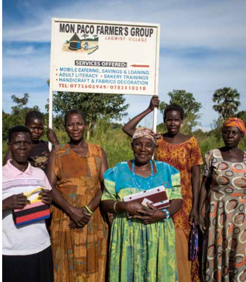
We must make sure that women and their practices are no longer made invisible, ignored or erased from memory.

Towards feminist leadership in African agriculture In the past years, we have learned a lot. Important questions for us are: how can we create different, non-hierarchical organisational forms and ways of leading? Leadership for what? To change what? For us, leadership is a means and not an end in itself. It has to be rooted in the values of the movement and an understanding of the change that we have to make in the lives of women. This implies deconstructing the concept of leadership, especially