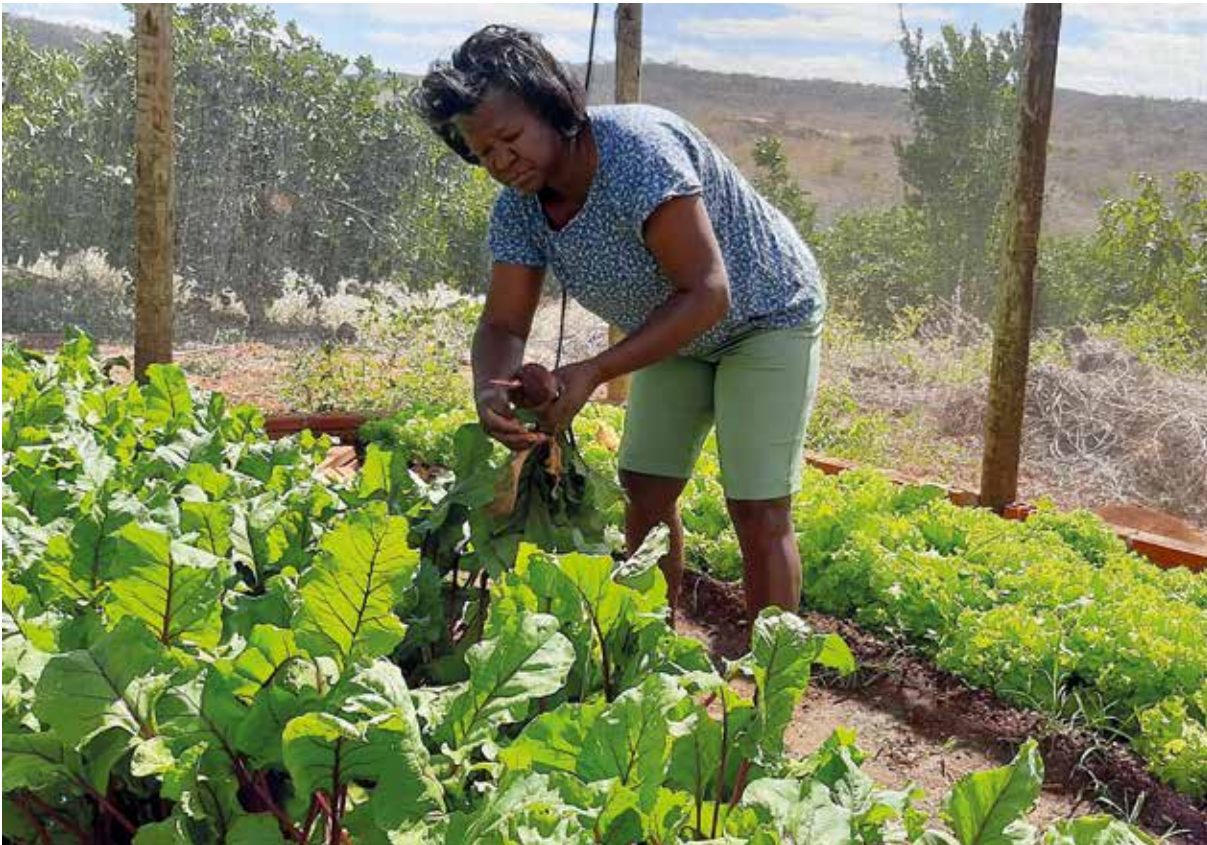
Harvesting beetroot at Fazenda Cigano, Riacho de Santana - Bahia, Brazil.

For example, from their reflections and actions, peasant women realised that a significant part of their production came from the home garden. While home gardens have a historical significance in securing food